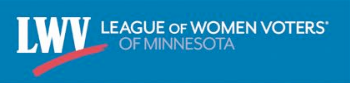
Article #5 in a series of articles about the 2022 Midterm Elections, brought to you by the League of Women Voters Minneapolis.

The general election is Tuesday, November 8. You can find important 2022 election information, including key dates and races, at <u>https://lwvmpls.org/for-voters/</u>.